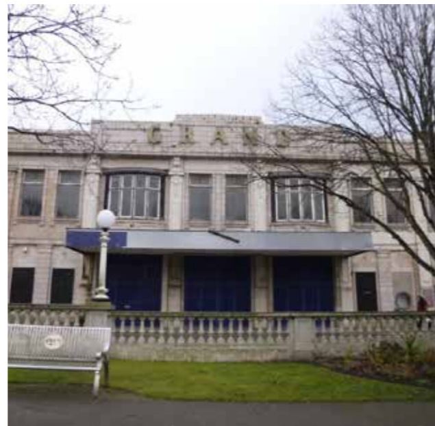
Former Grand Casino, Lord Street