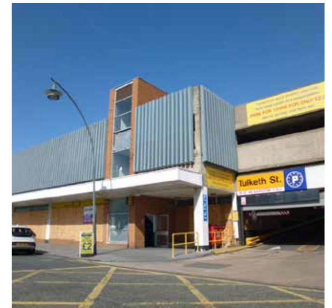
Tulketh Street Area