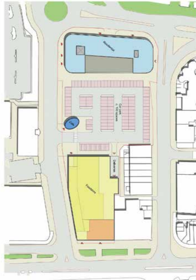
Kingsway Car Park and B&M Store

The Investment Framework is supportive in principle of the type of development potential suggested for the Kingsway and B&M Bargain's sites. These types of uses are in accordance with the town centre policies. However it's recognised that any re-development of the B & M Bargain's site is very much dependent on the vacation of the site by the current occupier and the revocation of the existing covenant if a food retail store is to be promoted